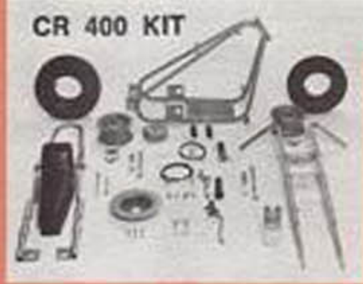
CR 400 KIT

MINI-CHOPPER . . . CR 400 — CR 410 — LEAN WAY BACK, REACH FOR THOSE CHROMED RISER HANDLEBARS AND GET THAT FEEL OF BEING IN COMMAND. HERE'S HOT HOT PERFORMANCE AND HANDLING WITH THE "FAR OUT" LOOK! STYLING: chromed extended fork and riser handlebars, low contoured seat, chromed sissy bar and chain guard, long wheelbase, baked high-gloss finish, mag-type wheels. PERFORMANCE: "Go" is handled by a powerful 4 HP - 172 CC engine, with a single speed clutch. RUGGEDNESS— toughest of mini bikes. Exclusive unlitized double-loop frame of high yield steel tubing. HANDLING: Long wheelbase makes it more stable than any other mini-bike. You sit "in" not "on it." This lowers the center of gravity and improves high speed stability. Front fork adjustable for rake. SAFETY: big internal expanding brake. Rubber covered foot rest. Full cover chain guard . . . (chrome gas tank optional). ALSO AVAILABLE IN A PRE-WELDED KIT FORM.