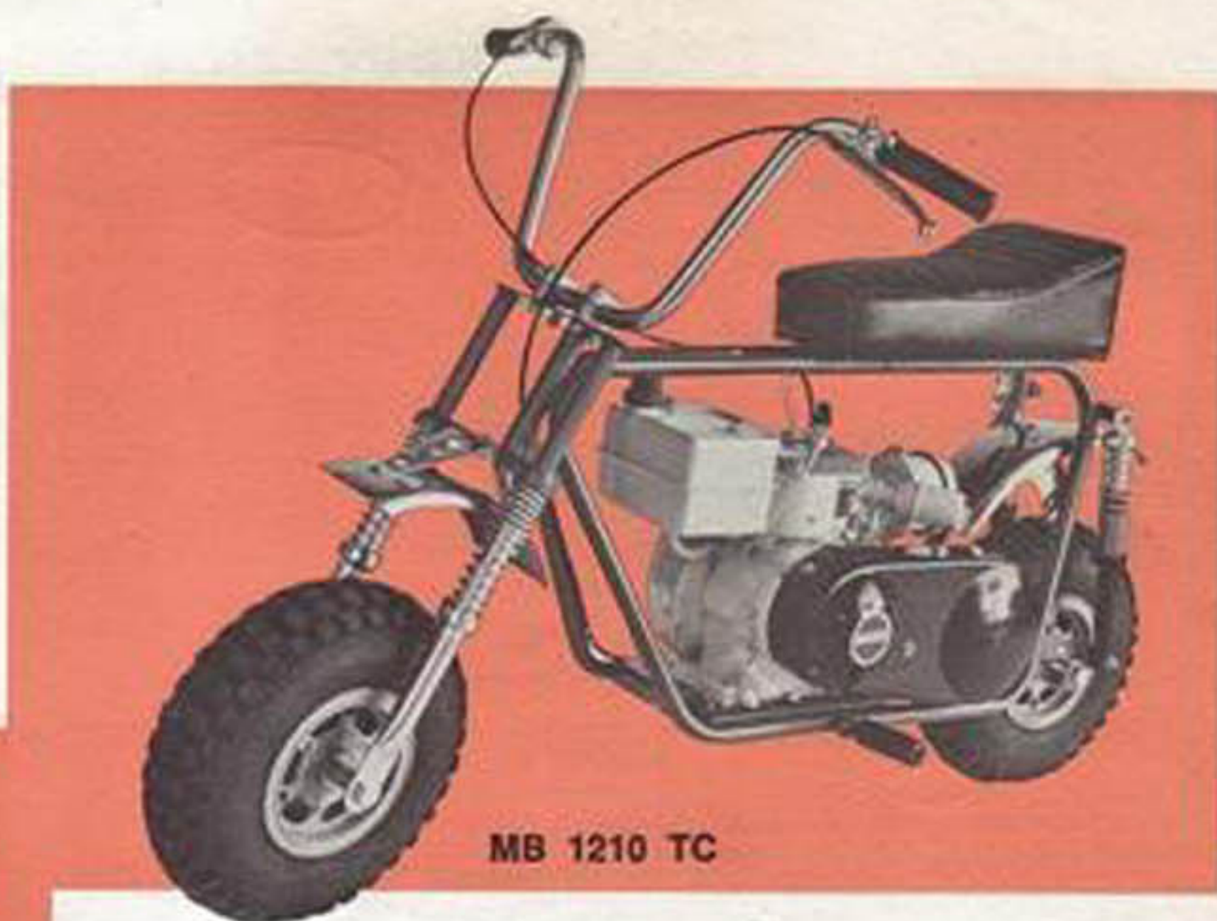
MB 1210 TC

A BONANZA DESIGN FOR THE SEVENTIES . . . MB 1210 — MB 1210 TC . . . STYLING: chrome extended fork, baked high-gloss enamel, mag-type cast alloy wheels with high speed ball bearing. RUGGEDNESS: Double-loop frame of high yield steel tubing. POWER: Dependable 153 CC, 3.5 HP and 4 HP, 4 cycle engine. MB 1210 — Uses a single speed clutch that eats up the trail. MB 1210 TC — A full range torque converter automatically gives you the ratio you need when you need it. PERFORMANCE — The same wheels, bearings, front suspension and frame type that set two world's motorcycle speed records at Bonneville. COMFORT: Extra-deep foam seat. Double acting front shocks with swinging arm rear suspension. SAFETY: Rubber covered foot pegs, internal expanding rear brake with dual shoes. PORTABILITY: Chrome folding handlebars make a package that can be stored in any trunk.