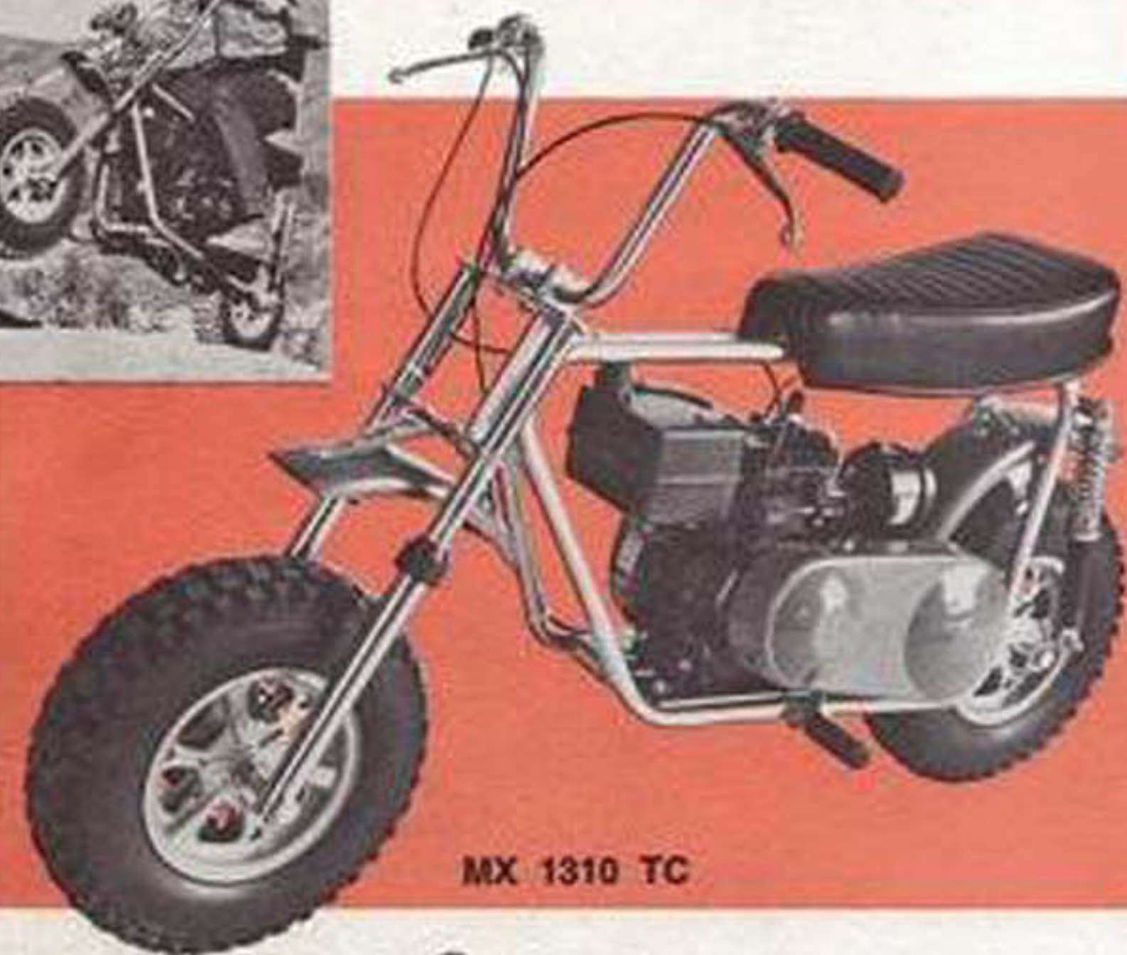
MX 1310 TC