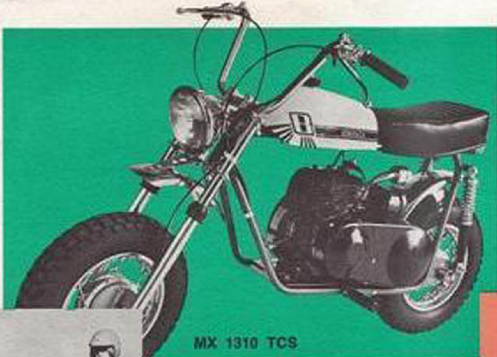
MX 1310 TCS