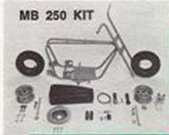
MB 250 KIT