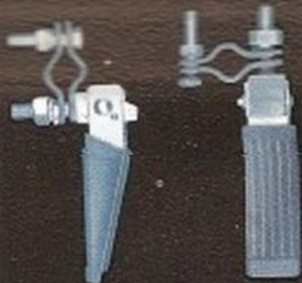
BUDDY PEDALS— FR-34