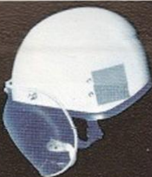
HELMET—HE-1 BUBBLE SHIELD— HE-2