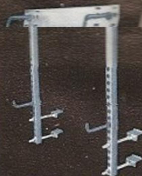
CAR BUMPER CARRIER MC-24