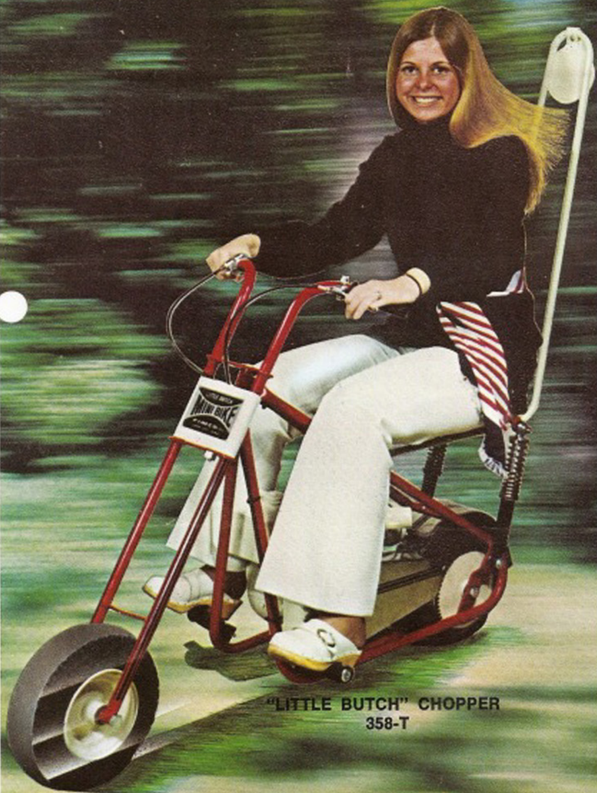
"LITTLE BUTCH" CHOPPER 358-T