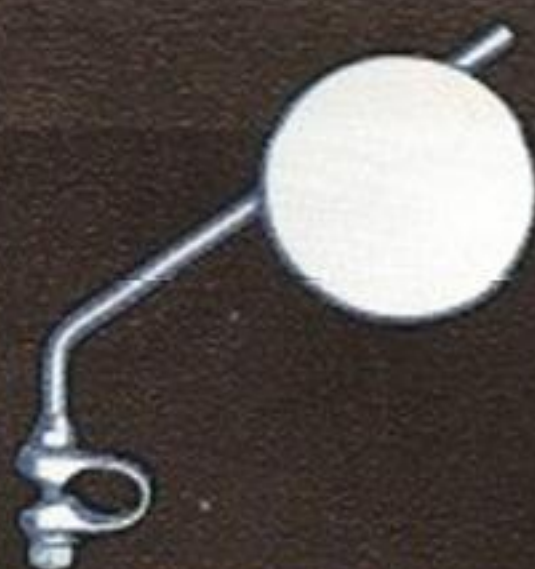
REAR VIEW MIRROR 40-0074