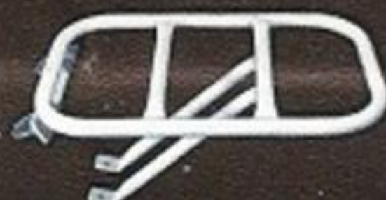
LUGGAGE RACK— SK-1