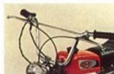
Motocross Handiebar (703-2 and 753-2) Extra strength and durability with chrome motocross handlebar. Adjustable and removable.