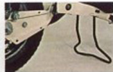
Stable riding comfort assured with "swing arm" rear suspension on "600" and "700" series. Note 3-point kickstand which is standard on all models.