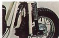
Front wheel suspension for "600" and "700" series is integral leading link and shock design.