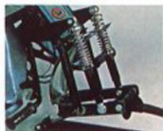
Double spring front shocks help cushion the bumps, whether with wheel or optional ski.