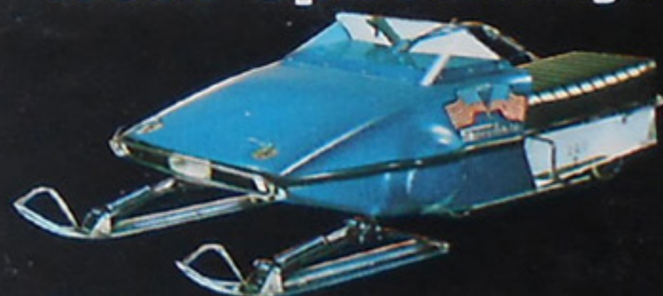
Speedway Sport Snowmobiles.