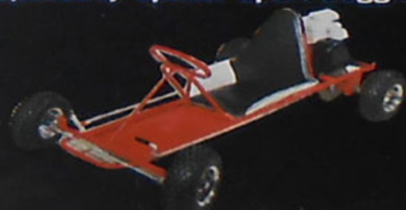
Speedway Fun Karts.