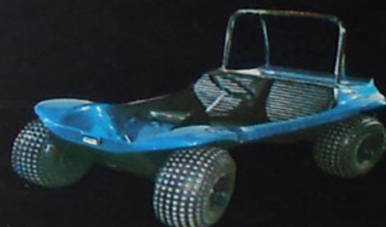
Speedway Spoiler Sport Buggies.