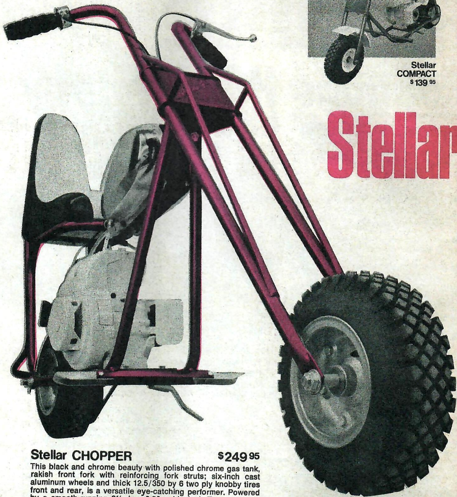
Stellar COMPACT $ 139 95