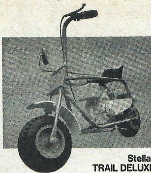
Stellar TRAIL DELUXE $189 95