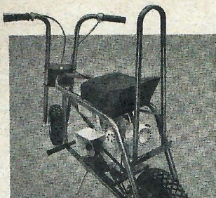
Stellar COMPACT DELUXE $159 95