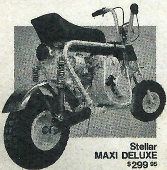
Stellar MAXI DELUXE $299 95